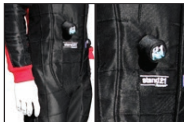
OPTION - AIR FORCE